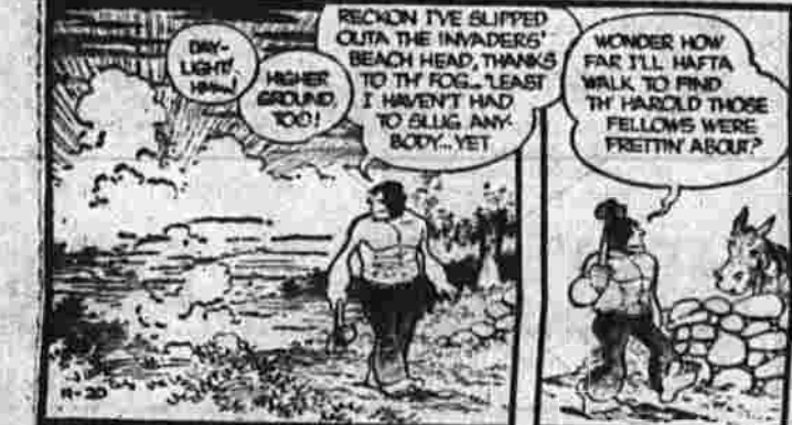
ALLEY OOP BY V. T. HAMLIN