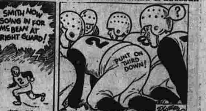
Got It BY MERRILL C. BLOSSER