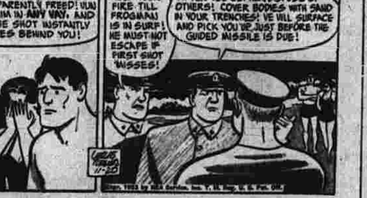
Decoy For Bib BY LESLIE TURNER