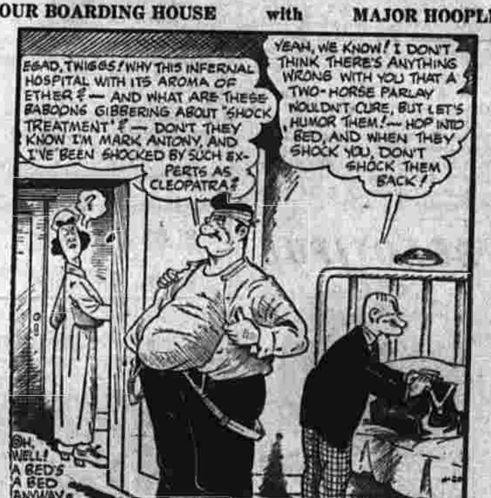
OUR BOARDING HOUSE with MAJOR HOOPLE BY V. T. HAMLIN