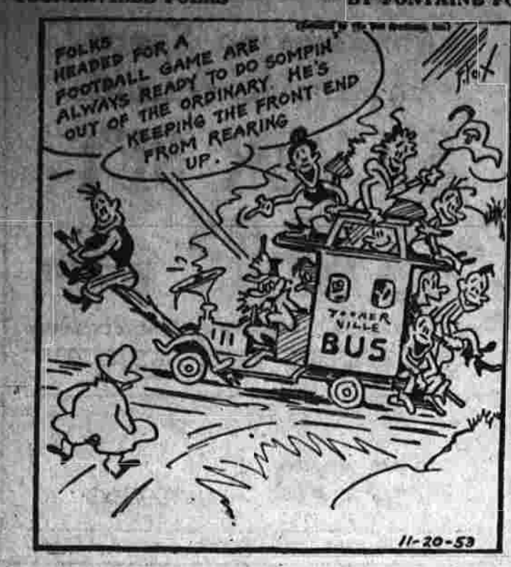
TOONERVILLE FOLKS BY FONTAINE FOX